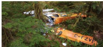
Investigation report: Collision with terrain involving a float-