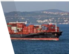
Concerned about Canada's marine emergency preparedness